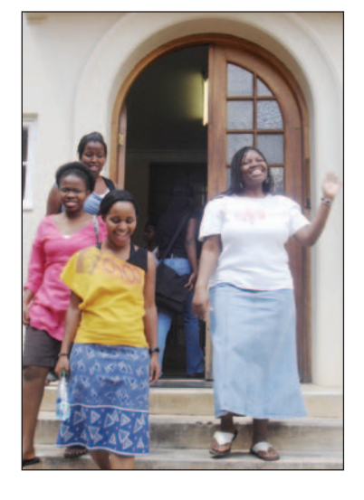
How safe are our residences?

Another receptionist, who was not on duty at the time, said they had been instructed not to talk about the incident before residence management had had a meeting and a black frame.